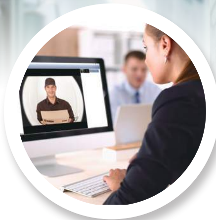
Receives live View and two way audio