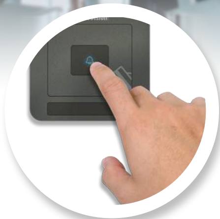
Touch and call